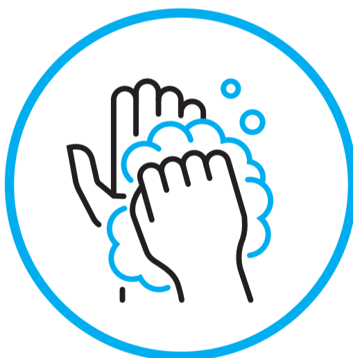
Hygiene and cleaning